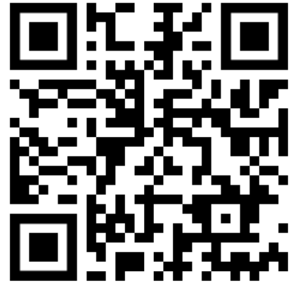
How-to video with BMW Connected App

We look forward to receiving your feedback on the BMW ConnectedDrive hotline, to help us continually optimize our remote software upgrade.